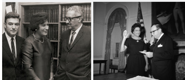
PHOTO LEFT. One of former U.S. Supreme Court Justice Thurgood Marshall's NAACP legal teams included Jack Greenberg (left) and Judge Constance Baker Motley. PHOTO RIGHT. In 1966, Judge Motley being sworn in as District Judge for the U.S. District Court, Southern District of New York.

On Monday, September 15, 2014, the New York Chapter, District Two, NAWJ's Fairness and Access Committee and the NAACP Legal Defense Fund (LDF) held a screening of the outstanding documentary film Justice is a Black Woman: The Life and Work of Constance Baker Motley . The Chief Judge of