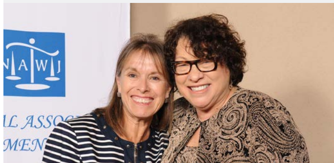
Judge Orlinda Naranjo with Justice Sonia Sotomayor at the NAWJ 2014 Annual Conference in San Diego.

Former District Director Judge Orlinda Naranjo of the 419th District Court and U.S. Supreme Court Justice Sonia Sotomayor